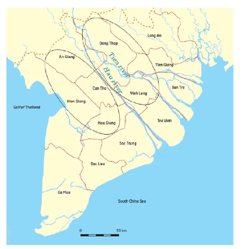
Fig. 1. Sub-regions in the Mekong Delta, Vietnam [23].

The data used for the calculation of annually generated rice straw are based on the average value of rice production over five years (2004–2008) obtained from the Statistical Yearbook of Vietnam 2008. Rice production in the Delta has increased in recent years, but will be reduced because of an urbanization rate of 2.5% per year and thus, the reduction of agricultural land [17].