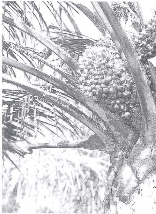
Fig. 3. Ripe bunches of oil palm fruits.

Figure 3 is a picture of the oil palm fruits. The fruits are produced in bunches. To get to the ripe fruit bunches so that they can be harvested, palm fronds may have to be cut. This is called pruning. Pruning can also be done on a periodic basis and not necessarily at the time of fruit harvesting. This practice generates large quantities of lignocellulosic biomass. Besides easier harvesting, other beneficial effects of pruning include easier visual assessment of fruit ripeness and easier access for pollination [5].