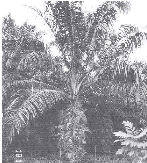
Fig. 1. The oil palm tree.

In Malaysia, the oil palm tree (Fig. 1) is cultivated for its oil. Oil extracted from the pericarp/mesocarp of ripe fruits is called palm oil while oil extracted from the kernels of the nuts of the fruit is called palm kernel oil. These oils are presently used by the world community for a variety of purposes as depicted in Fig. 2 [4].